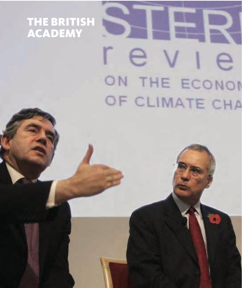
Sir Nicholas Stern FBA (now Lord Stern), launching his seminal review of The Economics of Climate Change with Chancellor Gordon Brown, October 2006