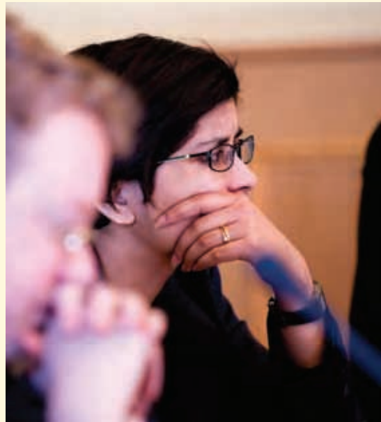
Shami Chakrabarti, director of Liberty, taking part in the British Academy Forum on human rights legislation, March 2010

And in France, in 2008, President Nicolas Sarkozy, commissioned leading economists, including Lord Stern FBA, Professor Joseph Stiglitz FBA and Professor Amartya Sen FBA, to develop alternative measures of progress to GDP that would better reflect people’s well-being and France’s famed “quality of life”. 46 Such examples clearly highlight the role that high quality, evidence-based UK social science research can play in helping define governmental strategies for addressing fundamental social challenges.