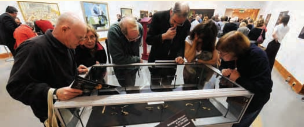
The Staffordshire Hoard on display in Birmingham Museum and Art Gallery, November 2009

Over the last decade, the pivotal economic importance of the creative, cultural and media industries – and the role that arts, humanities and social research plays in fuelling and sustaining them – has been recognised by the European Commission, the World Bank, and national and local governments. Their importance is likely to increase as changing social trends result in heightened demand for leisure activities.