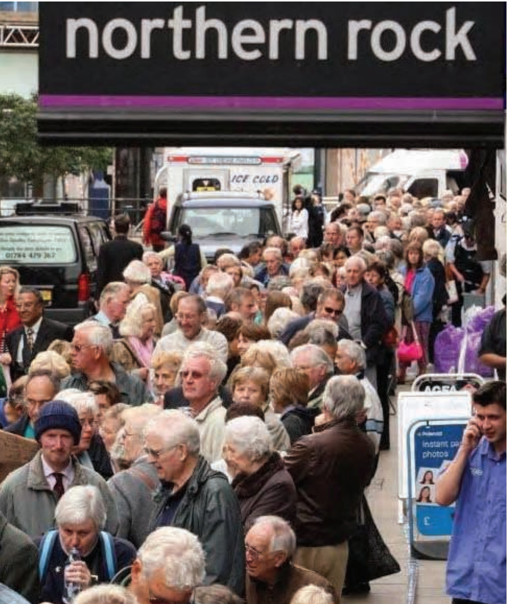
Northern Rock collapse, September 2007. Customers wait in line to remove their savings