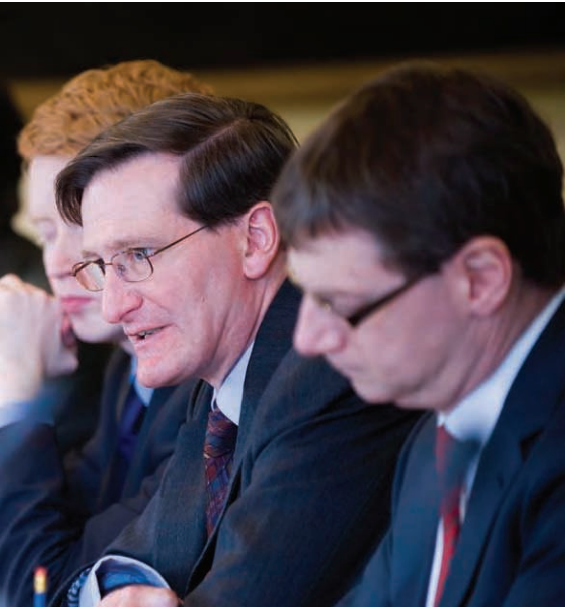
Dominic Grieve MP leading a British Academy Forum on human rights legislation, March 2010