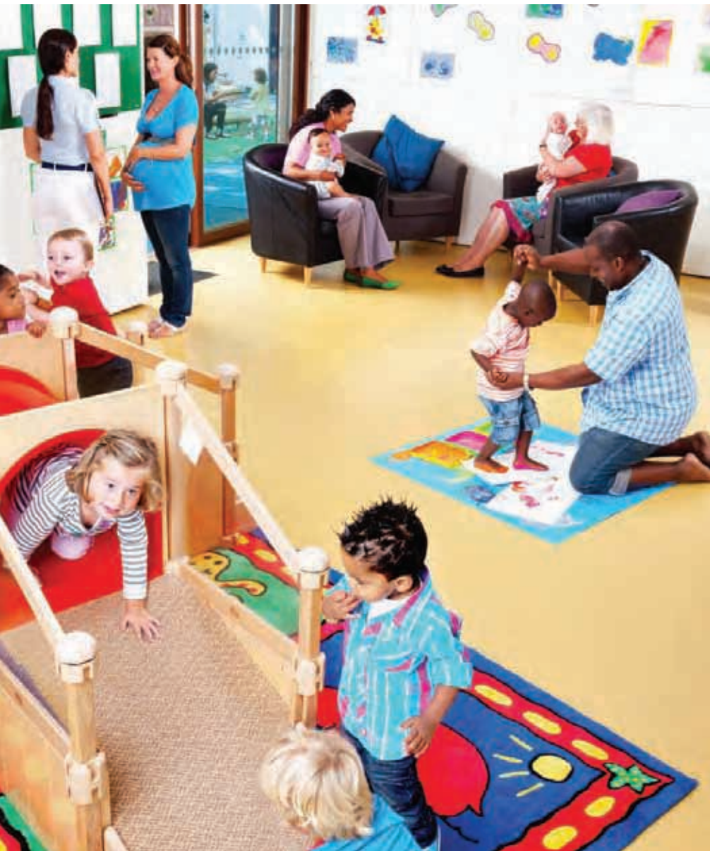
The Sure Start initiative. By mid-2009 more than 3,000 Sure Start centres had been established across the UK