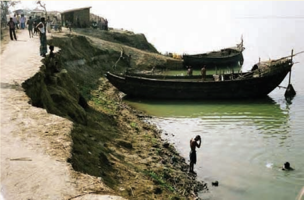
A collapsing road in the Bengal Delta

Long term research relationships and collaborations with overseas partners can also bring economic benefits. For example, British research in archaeology and environmental impact supported by the Society for Libyan Studies has recently facilitated the contacts and goodwill necessary to generate more than £1 million of commercial contract work in Libya for UK companies. 100